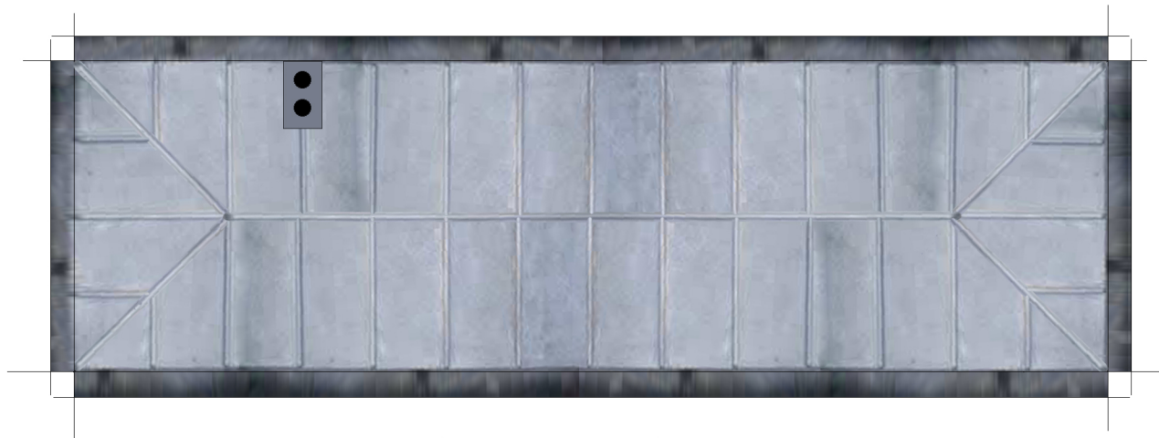
Roof layer 2 - platform side Turn edges over and glue onto roof layer 1