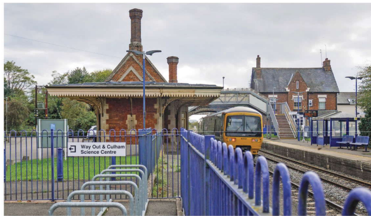
▲ The north end of the structure, with a Class 165 DMU departing for Didcot on 18 October 2018.

Heritage in 1975), there are set to be significant changes to the surrounding station site over the course of the next few years, with electrification of the route and extensions to the platforms planned.