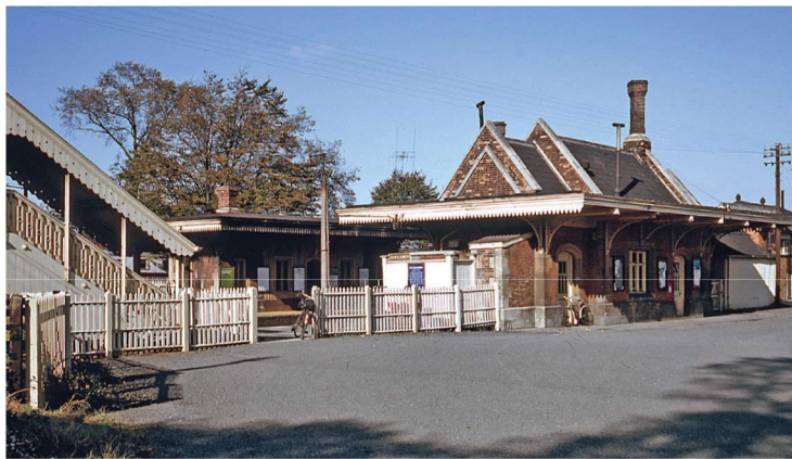
▲ The view from the roadside approach recorded on 17 October 1964. Note the lack of canopy valancing along this side.